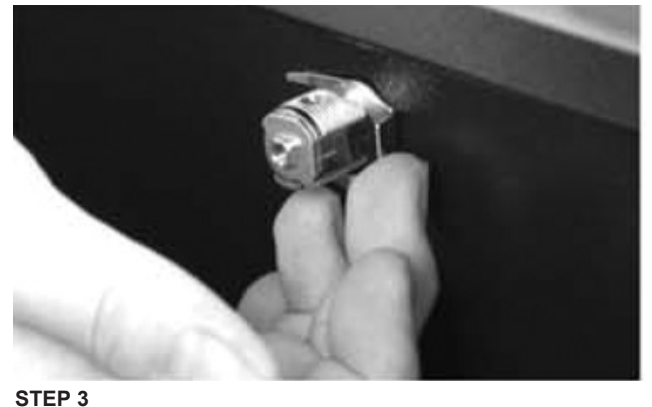
ATTACH RETENTION CLIP TO REAR OF LOCK